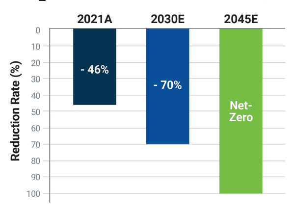
Targets vs. 2005 levels. Assuming key technology, policy, and regulatory enablers are in place. A=Actual E=Estimated

• Wind Generation . Evergy has been expanding wind energy production in the Midwest for years. With almost 4,400 megawatts of wind generation that we own or have under contract, our wind portfolio helps fuel Kansas' state ranking as the second largest producer of renewable generation as a percentage of total generation in the United States.